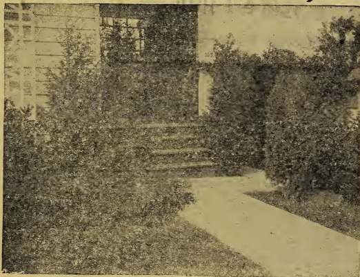
A FOUNDATION PLANTING

62.57 1927 Catalog What is a home without some plants?